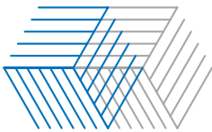
Figure 2: A first time the logo of FBI

To insert multiple figures below or besides each other, we integrated the package floatrow into the document class (see floatrow Dokumentation). An exemplary application for a two-column layout is shown by 2 and 3: